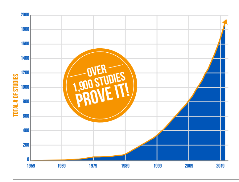
Helps Support Reduction of Oxidative Stress